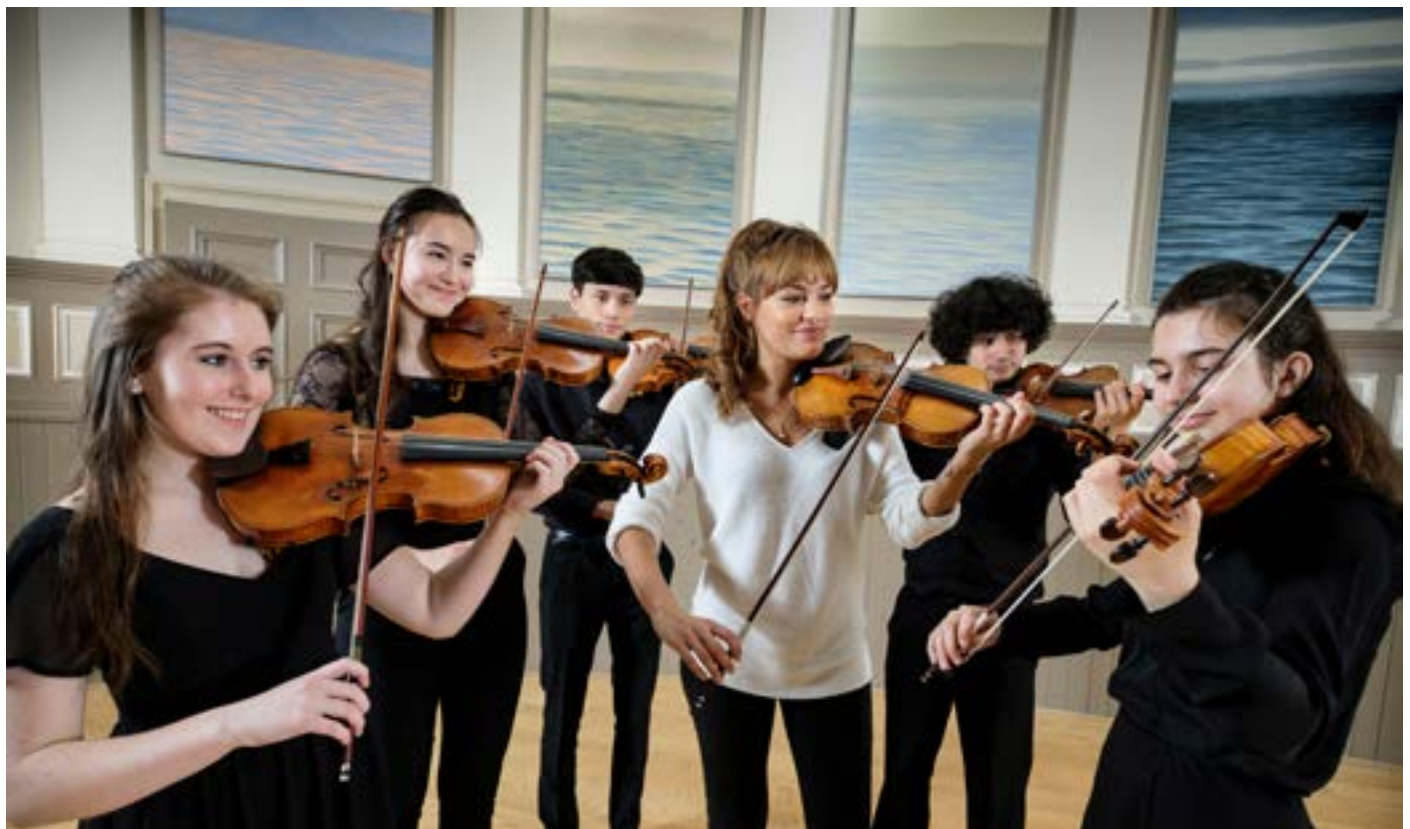
Nicola Benedetti conducting a violin masterclass

Boarding and day places are available. Day places are open to applicants from primary 5 (age 8/9) and above. Boarding places are open to applicants in S1 (age 11/12) and above.